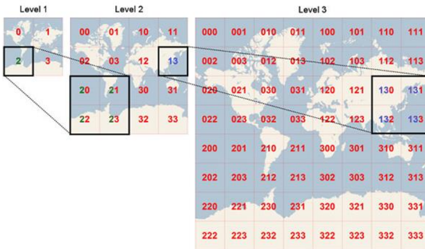
Figure 2 : Quadtree structure

More information is available in: http://www.maptiler.org/google-maps-coordinates-tile-bounds-projection/ .